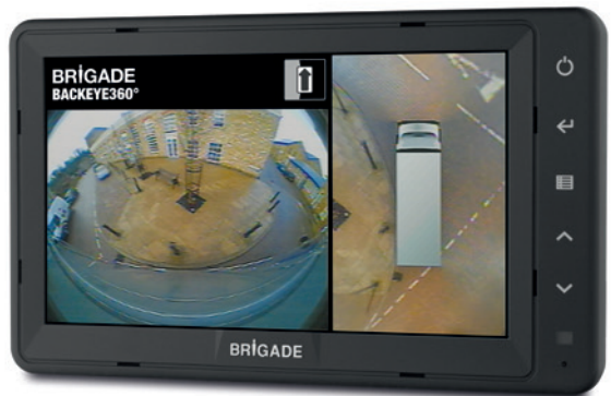
Actual Backeye®360 image

The flexibility of the Brigade systems means there are solutions suitable for both on-and off-road applications.